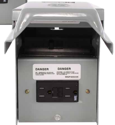
Non-automatic with 15 Amp GFCI Receptacle TNA60RGFR