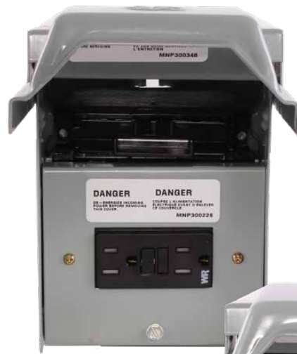
Pullout with 15 Amp GFCI Receptacle TFN60RGFR