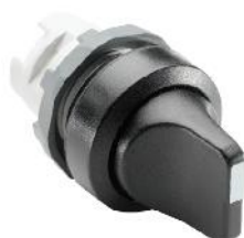
Selector Switch, short handle