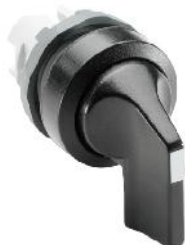
Selector Switch, long handle