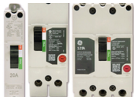
Lighting Panel Circuit Breakers