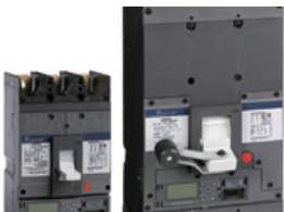
Spectra RMS* Electronic Trip