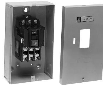
Type 1 Surface Mounting