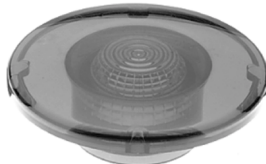
Illuminated Jumbo Mushroom