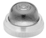
Glass Caps for Pilot Lights