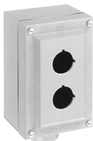
Rosite Glass Polyester Cat. No. 800H-2HZ4R