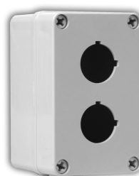
Thermoplastic Polyester Cat. No. 800H-2HZ4C