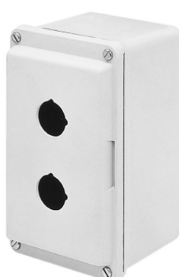
Fiberglass Cat. No. 800H-2HZ4Y