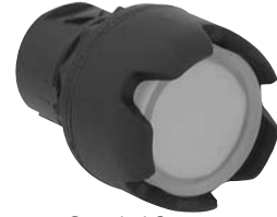
Guarded Operator Cat. No. 800FP-LG3