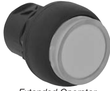
Extended Operator Cat. No. 800FP-LE3