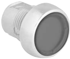
Flush Operator Cat. No. 800FM-LF4